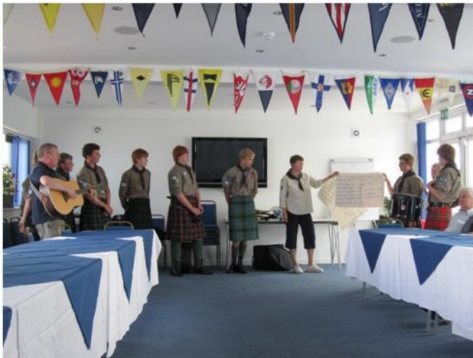
Selkirk Scouts and Leaders.

We spent a pleasant afternoon at the Guernsey Yacht Club with entertainment being provided by the Selkirk Scout Group. They were on the Island camping at Rue Maingy and offered to entertain our Thursday Afternoon Group. We enjoyed the bagpipes and a selection of Scottish tunes.